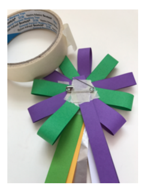
Attach a safety pin or paperclip.